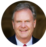
Jim Desmond Commissioner County of San Diego