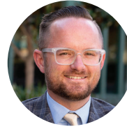
Dane White Commissioner City of Escondido