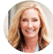
Kristi Becker Commissioner City of Solana Beach