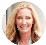
Kristi Becker Commissioner City of Solana Beach