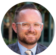
Dane White Commissioner City of Escondido