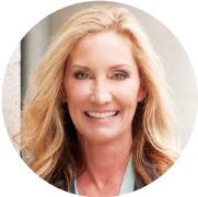
Kristi Becker Commissioner City of Solana Beach