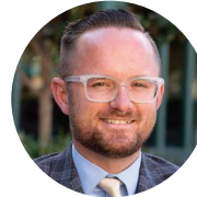
Dane White Commissioner City of Escondido