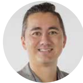
Chris Cate Commissioner City of San Diego