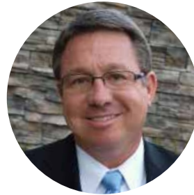
Bill Wells Commissioner City of El Cajon