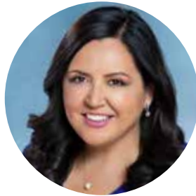
Nora Vargas Commissioner County of San Diego