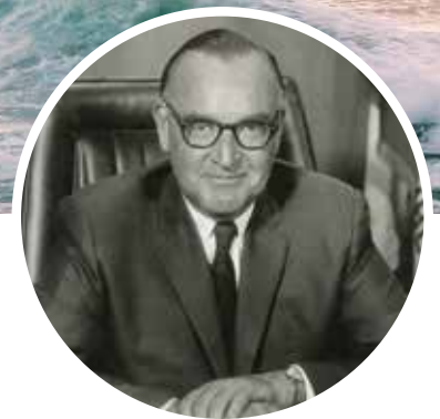
Governor Edmund "Pat" Brown Sr.